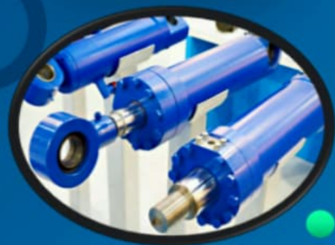
Hydraulic Cylinder Repairs